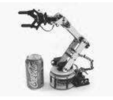
Fig. 2: Lynx 6 Robotic Arm.

Robotic arm LYNX6 can be part of the robot and can be controlled by robot's microcontroller or it can stand alone, because it has its own controller. The controller is SSC-32 and has a microprocessor Atmel inside and allows to control up to 32 servos. The arm has seven servos Hi-Tec and six degrees of freedom. Servos are controlled by length of pulses sent from the controller. The length varied from 1ms to 2ms, which corresponds to the end points of the arm movements. In case the length of the pulse is 1.5ms, the arm is in its mid position. The controlling of servos is similar to controlling of the motors.