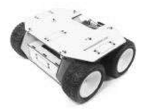
Fig. 1: Robotic Kit for Autonomous Behaviour.

The chasis is made of lexan with aluminum stiffeners. Four motors has extended shaft for connecting encoders and are energized by 7.2V battery pack. The kit is supplied with three IR sensors which measure distance from 10cm to 80cm, but they are reliable only on the beginning of this range, that is why they are usable only as additional sensors. The most important part of kit is BotBoard with a microcontroller. It has 4 analog and 16 digital I/O pins which allow connecting of many accessories. The BotBoard also has three pushbuttons with LEDs, speaker and connector for PlayStation2. The microcontroller in the Bot-Board can be Basic Atom, Basic Atom Pro, Basic Stamp and others. This particular robot is equipped with Basic Atom Pro based on processor Hitachi 3664 and programmed by special kind of Basic language developed for this processor. The advantage of this approach is that user can simply handle with I/O pins of the board, I2C interface and can use commands created specially for controlling of the robot. The motors are controlled from BotBoard via Scorpion board, which is dual H-bridge motor controller. From BotBoard are send signals to the Scorpion. According to the length of pulses, which can be from 1ms to 2ms, the motors rotate in one direction (if length is between 1ms and 1.5ms) or opposite direction (if length is between 1.5ms and 2ms), if the length is 1.5ms the motors are stopped. The more the length is to 1ms or 2 ms, the faster are the motors rotating.