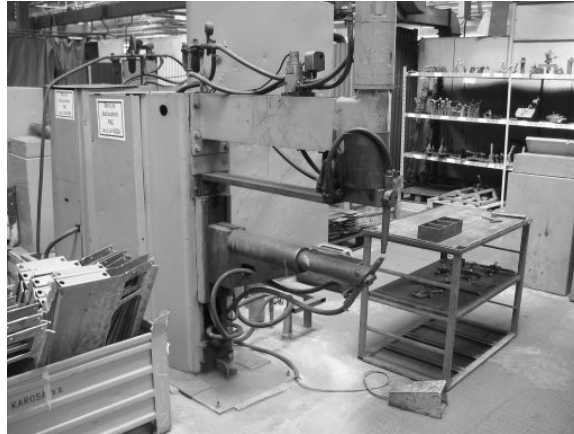
Fig. 1: Machine for dots welding.