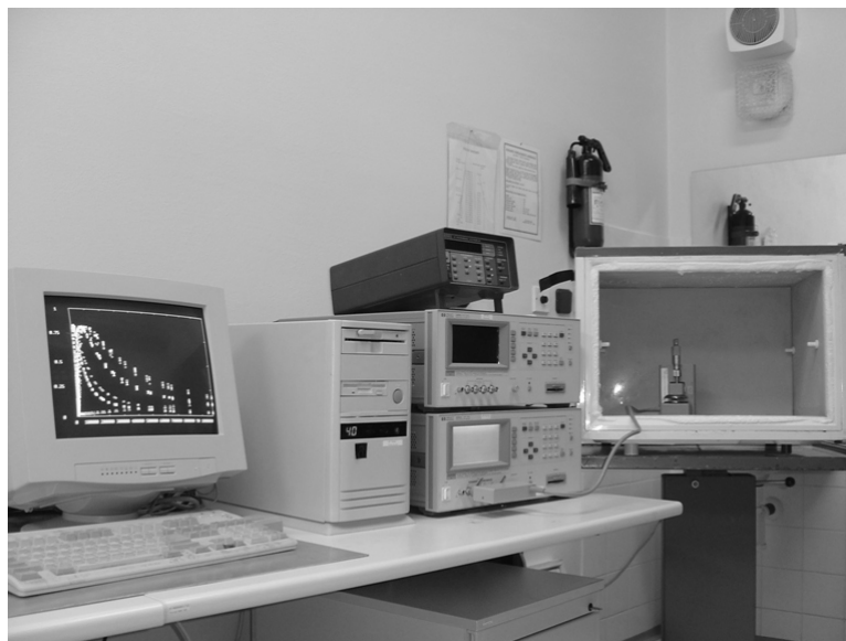
Fig. 1: Equipments for the measurments in the frequency domain.

Measurements in the frequency domain were carried out on the Hewlett Packard HP 4284A precision LCR meter and dielectric test fixture capacitor HP 16451B. Measuring with the precision LCR meter is based on bridge techniques with auto-calibration and its measured results are available over the frequency range 100 Hz - 1 MHz. It is necessary to carry out corrections before each measuring to avoid errors during the measuring. The sample was analyzed in the temperature chamber, which was for this experiment shown in Fig [1].