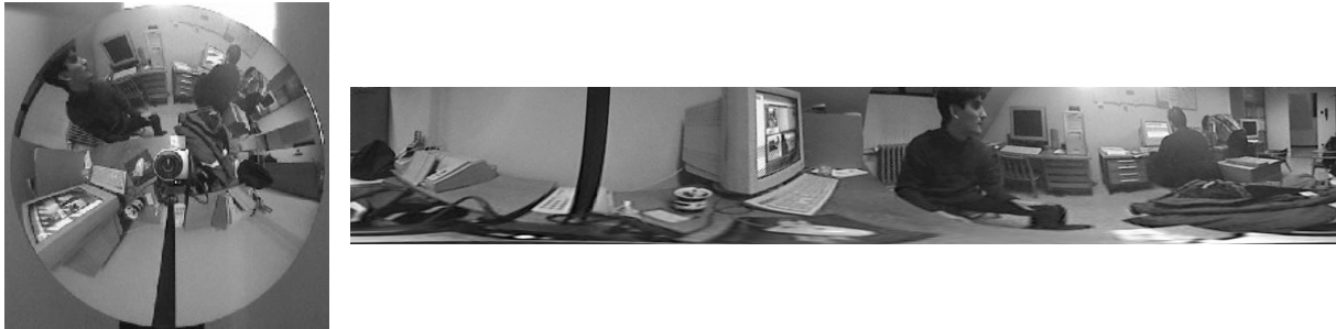
Fig. 3: Original and unwrapped image

The Sony DCR-TRV310E digital camera and Neovision hyperbolic glass mirror H3G with mirror holder were used. The captured sequence is unwrapped into normal panoramic image sequence that can be seen in the figure 3. An algorithm with pixel value averaging is sufficient for this task.