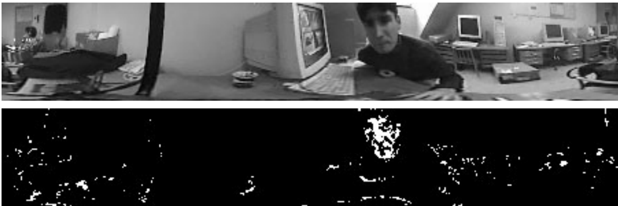
Fig. 4: Skin color detection

The pixels for skin detection are picked manually from skin regions. Figure 4 shows detected areas that contain skin pixels. Often the results of skin color detection either contain noise, or many colored objects create considerable clutter in skin probability image and thus make skin regions not so clearly distinguishable.