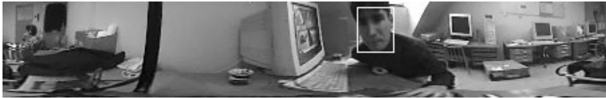
Fig. 5: Object tracking

tracked object when it disappears. The tracked objects are marked by rectangle seen in figure 5.